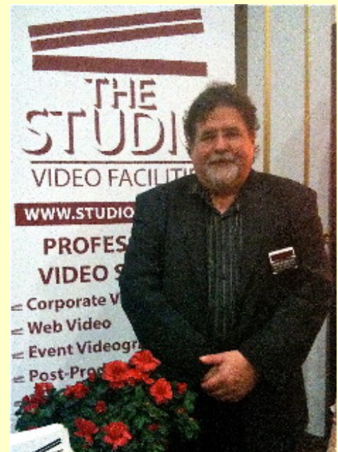
At the Barter First Trade Show