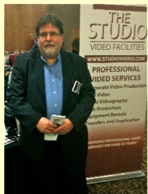
At the Jewish Events Trade Show