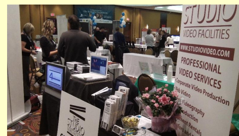
At an ESN Event