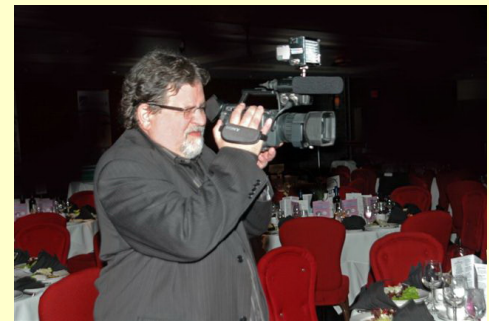
At the Richmond Chamber of Commerce 33rd Business Excellence Awards