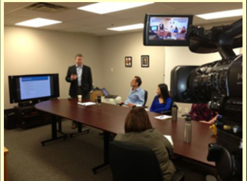
Training Seminar Royalty Rewards