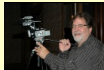
At Richmond Chamber AGM with New Camera

http://vimeopro.com/studiovideo/the-studio- video-facilities-events