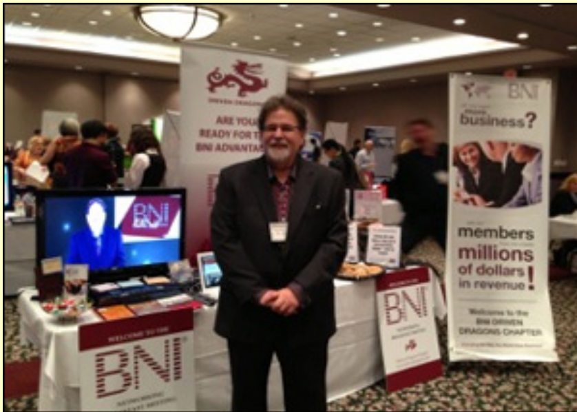
At ESN Trade Fair with BNI