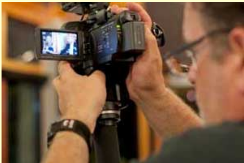
What I see..

Providing Professional Video Services..since 1985