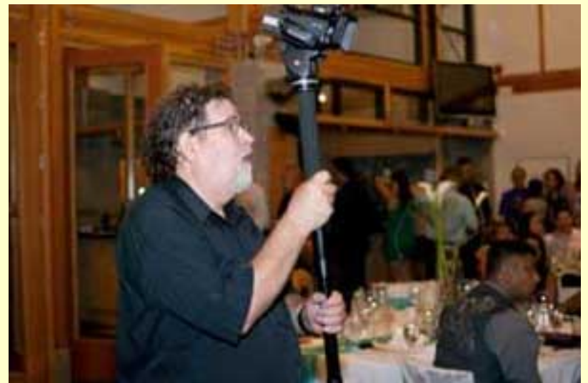
Getting the shot

Let The Studio create an ever-lasting memory for you!